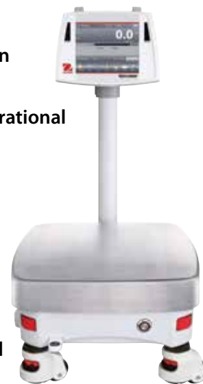
Shown with optional tower mount and rolling feet